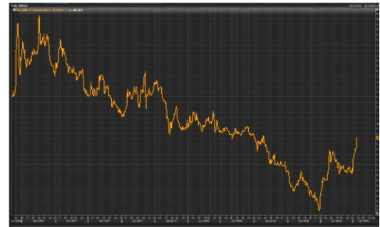
Figure 1 – GURE share price

Eighteen months ago the Chinese Government as part of its latest environmental drive instructed the Company, as well as most bromine producers in China, to close all its bromine and chemical operations for rectification in order to comply with new environmental legislation. With no revenue the share collapsed.