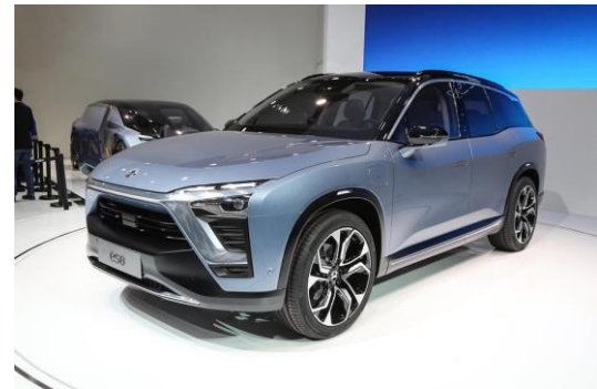
Figure 1 - NIO SUV